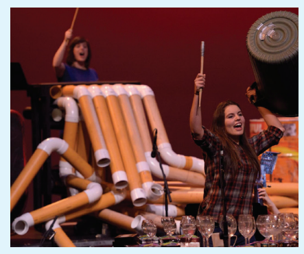
The Music of Junk